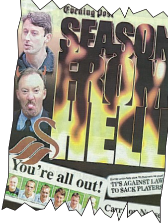
HELL How the Post reported on the 2001-02 campaign.

and he just tossed it on the floor. That was his parting shot."