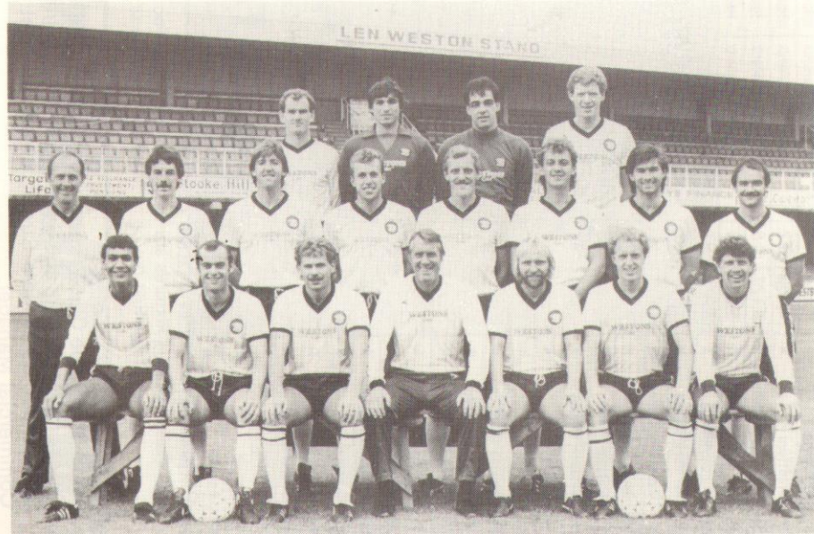
HEREFORD UNITED F.C.